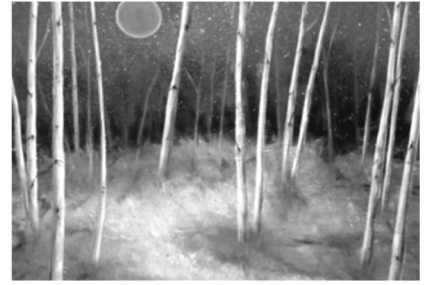
"Blue Moon Birch Trees" by Lora Marsh