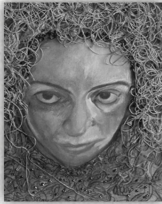
"SP #4" by Georgia Akers