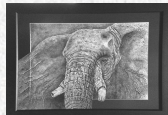
"Broken" by Shelley Poli

The Gallery on Gazebo's current exhibit, which runs through the end of March, is titled "Food as Art" . To create more excitement for the exhibit, Gallery on Gazebo will be announcing a series of workshops, classes, presentations and forums, all centered around the preparation and presentation of food as art and its importance in our lives a connection with others. For a schedule of the activities and gallery hours, contact (814) 539-4245 or check the website at www.galleryongazebo.org .