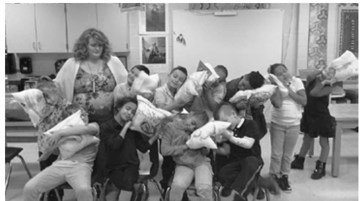
Students having fun with “Dream Pillow” project.

One of the programs I work with - “Art Expressions Inc.” was recently named one of the 50 national finalists for the 2017 Presidential Arts & Humanities Youth Art Program Awards. Our founder indicated that our application for this year was primarily based on the work I did as an art facilitator at Jeanette Elementary School. I am crossing my fingers awaiting announcement of the final top 12 Award-ees, who will get to participate in a 3 day arts programming conference in DC, a $10,000 monetary award which could provide funding for “Art Expressions” to return to Jeanette next year as well as introduce our program to other disadvantaged schools. (My dream is to bring “Art Expressions to Johnstown.) I believe Michelle Obama presented the awards last year. Final winners to be announced any day now, but making the top 50 is a valuable way for our program to get its foot in the door at new schools and seek funding.