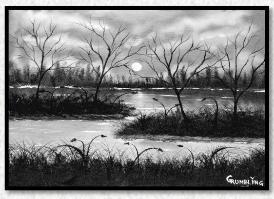
"Moonlit Lake" by Brian Grumbling