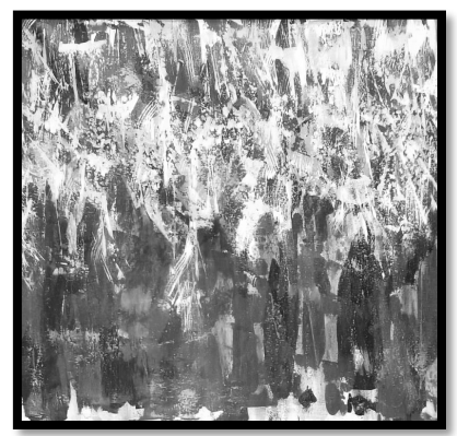
"Crown of Thorns" by Beckie Pender