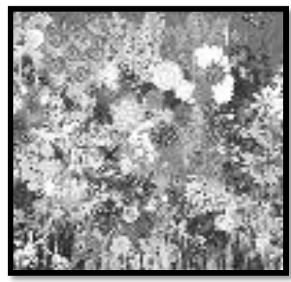
"Serene Smell" by Zone Patcher