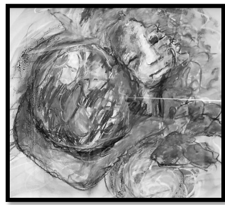
"Untitled" by Susan Novak